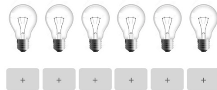
Figure 1. A set of six light switches and lights. Which switch maps to which light?

Stimulus. The stimulus was a depiction of a set of six light switches and six lights (Fig. 1). When pressed, the switch turned on one of the lights for 1000 ms.